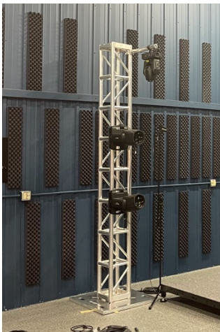
10 Foot Truss Tower with 30" Base

Five 10' truss towers (of similar design and configuration to the photos below) will be made available to accommodate Artist's effects lighting show.