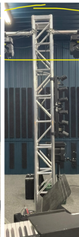
Tower 2 Config