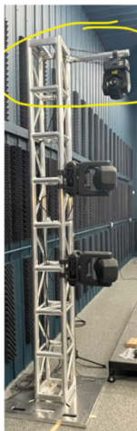
Tower 1 Config