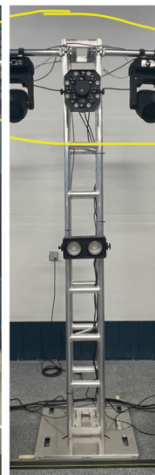
Tower 3 Config