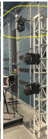
Tower 5 Config