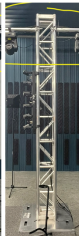
Tower 4 Config